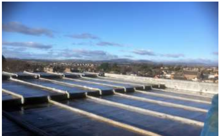
Looking north across the tower roof. Patches on top of patches!

The tower roof is in very poor condition, the lead covering having been patched and then patched again is now past the end of its realistic lifespan, so rather than yet another temporary patch, the plan is to do the job properly, thereby keeping the integrity of our beautiful church for generations to come. Money, as always will need to be raised for this, and again grant assistance is being sought.