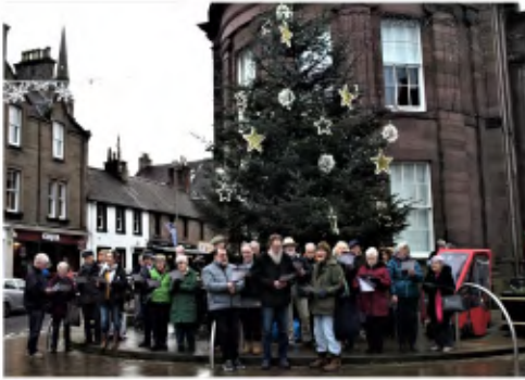
Carols at The Cross

As always there was a lot going on over the Christmas season, and 2019 was no exception - FACT organised a very good Advent study group in the Forfar Community Church, well attended from all the Forfar churches, comfortable and warm with very welcoming refreshments. Not quite so well attended was the carol singing at the Finavon Care home, but the residents clearly enjoyed the carols and it was lovely to see them.