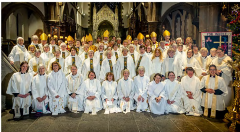
Picture taken at the celebration of 25 years of the Ordination of Women at St. Ninian’s Cathedral, Perth