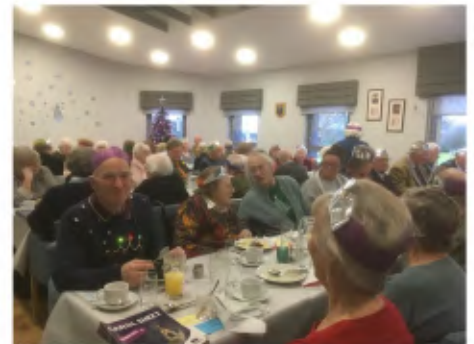
Golden Group Christmas lunch

took the form of a children's party - the gift of Christmas doubling up as a 'pass the parcel' game. It was so encouraging seeing quite a few children there, clearly enjoying the service. It was a wonderful way to start the day.