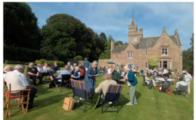
Memories of summer